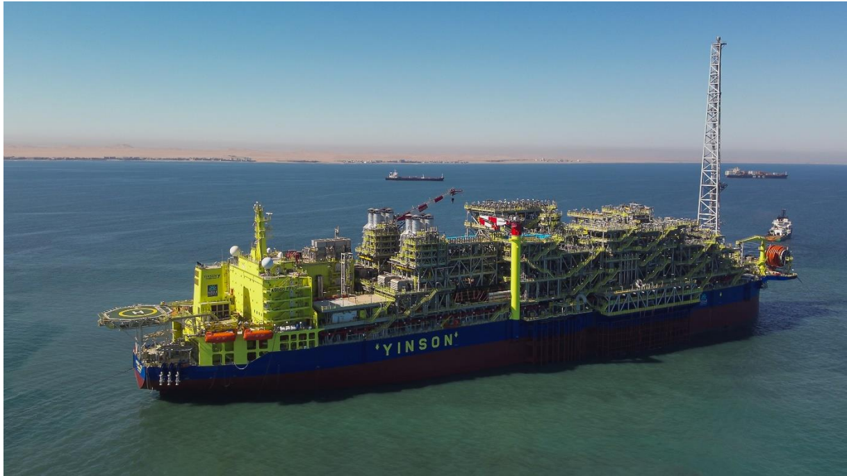
Agogo FPSO at Walvis Bay, Namibia