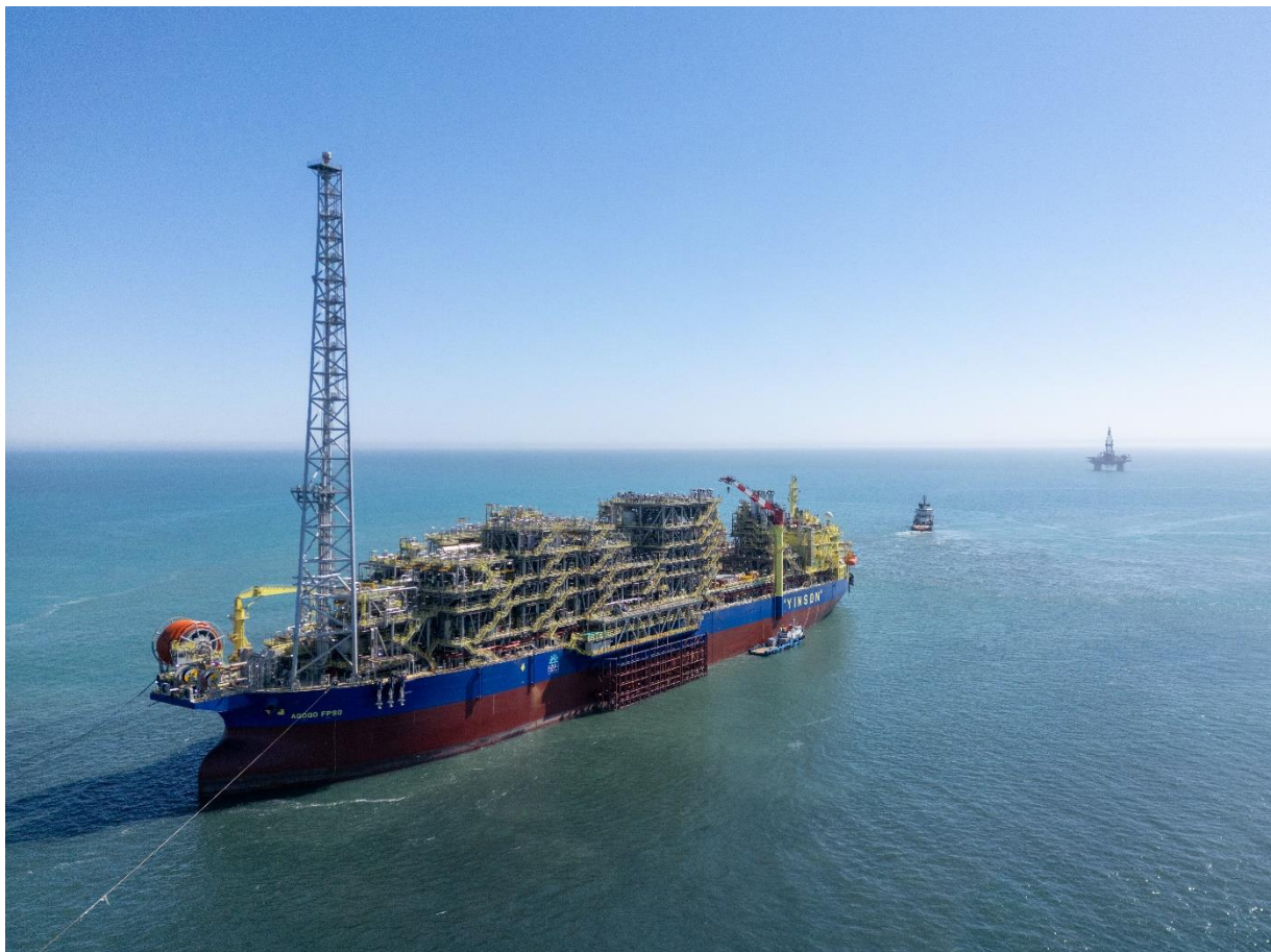
Agogo FPSO at Walvis Bay, Namibia