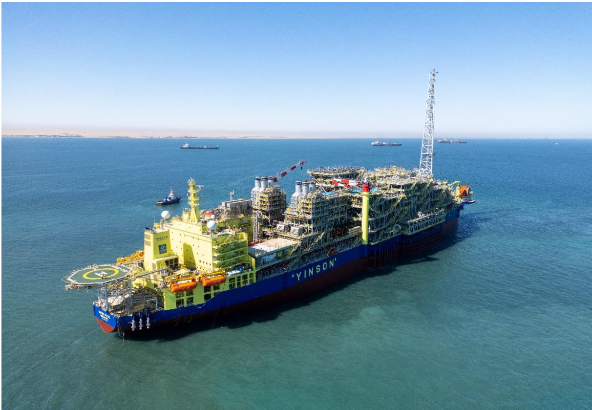
Agogo FPSO at Walvis Bay, Namibia